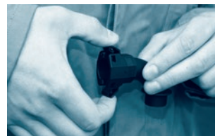
Step 6: Push the detent lugs in (NORDUC® assembly system ready to use again).