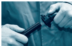
Step 5: Pull the corrugated tube out of the connector.