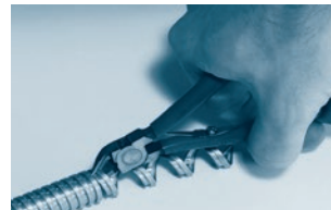
Step 3: Cutting of the protruding profile with a shear blade or diagonal cutting pliers.