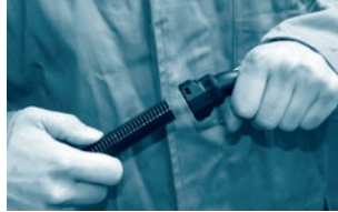
Step 2: Insert the tube into the „closed“ connector as far as it will go (to assemble the connector).