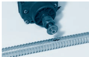
Step 2: Bend the metal hose.