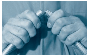
Step 2: Bend the metal hose.