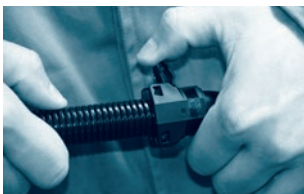
Step 4: Move the detent lugs out (to dismantle the connector).