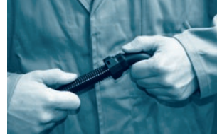
Step 3: Pull the corrugated tube back slightly inside the connector (to latch securely).