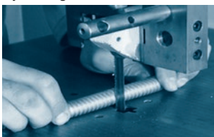
Step 1: Cut the metal hose on a belt saw at high cutting speed.