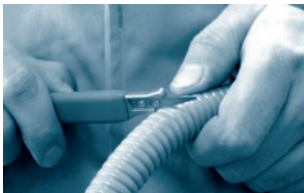
Step 1: Cut the plastic mantle (if existing).