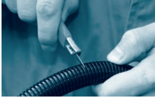
Step 1: Separate the tube at a corrugation crest (optimal protection of the tube and connector).

Due to the conic inside and the snap in hooks, the connector is universal suitable for different tube profiles. (Standard-, Coarse- and UFW-profile) IP 65 is reached acc. to EN 60529/IEC 60529 in this combination. The IP 68 rate is attained with an O-ring sealing, mounted in the first wave trough of the tube (trade size 50 in the first and second groove).