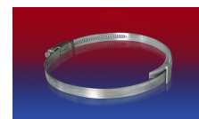
CLAMP 210 BRIDGE CLAMP

Overpressure and underpressure are recommended threshold operating values, products can be subjected to higher loads upon request. The bending radius is measured through the inside of the hose arch. The right to make technical modifications is reserved. All values determined at 20°C and are approx. data. Additional information at www.norres.com/en/technology/ .