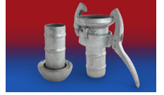
CONNECT KARDAN 254

Overpressure and underpressure are recommended threshold operating values, products can be subjected to higher loads upon request. The bending radius is measured through the inside of the hose arch. The right to make technical modifications is reserved. All values determined at 20°C and are approx. data. Additional information at www.norres.com/en/technology/ .