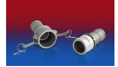
CONNECT KAMLOK ALU 253

Overpressure and underpressure are recommended threshold operating values, products can be subjected to higher loads upon request. The bending radius is measured through the inside of the hose arch. The right to make technical modifications is reserved. All values determined at 20°C and are approx. data. Additional information at www.norres.com/en/technology/ .