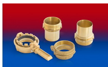
CONNECT TANK TRUCK BRASS 252