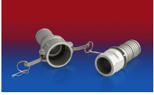
CONNECT KAMLOK ALU 253