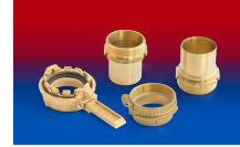
CONNECT TANK TRUCK BRASS 252