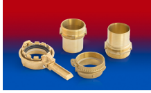
CONNECT TANK TRUCK BRASS 252