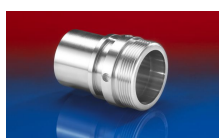
CONNECT THREAD FITTING 234