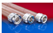
CONNECT SAFETY CLAMP ASSEMBLY 231