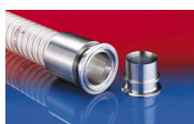
CONNECT PRESS ASSEMBLY 232