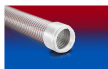
CONNECT 245 FOOD