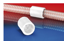
CONNECT 246 FOOD