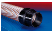
CONNECT 240 + 241 AS