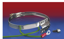
CLAMP 212 EC