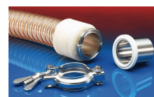
CONNECT TRI- CLAMP FITTING 245