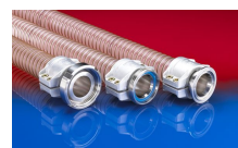
CONNECT SAFETY CLAMP ASSEMBLY 231