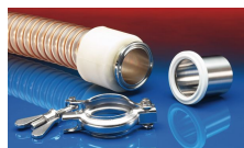
CONNECT TRI-CLAMP FITTING 245