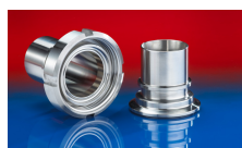
CONNECT ASEPTIC FITTING 249