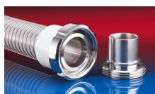
CONNECT MOULD ASSEMBLY 233