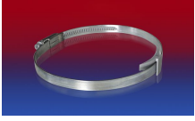
CLAMP 210 BRIDGE CLAMP