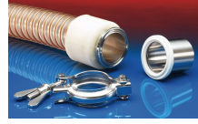
CONNECT TRI-CLAMP FITTING 245