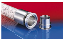
CONNECT PRESS ASSEMBLY 232