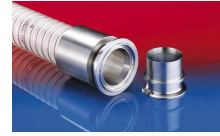
CONNECT PRESS ASSEMBLY 232