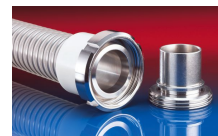
CONNECT MOULD ASSEMBLY 233

Positive and negative pressure ratings are the recommended maximum operating values. Products can be manufactured to meet higher operating values upon request. The bend radius is calculated from the center of the hose in an arched position. Additional information at www.norres.com/us/technology/ . NORRES reserves the right to modify technical data at any time. Technical data based on tests at 68 °F and are approx. values. Proper use and maintenance of NORRES hoses is the sole responsibility of purchaser and ultimate user of the product. The individual conditions, applications and the number of variables make firm recommendations technically impossible. This information is intended as a general guide only.