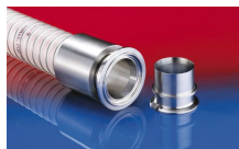
CONNECT PRESS ASSEMBLY 232