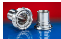
CONNECT ASEPTIC FITTING 249