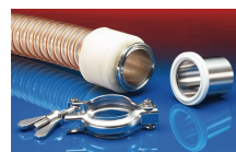
CONNECT TRI-CLAMP FITTING 245

Overpressure and underpressure are recommended threshold operating values, products can be subjected to higher loads upon request. The bending radius is measured through the inside of the hose arch. The right to make technical modifications is reserved. All values determined at 20°C and are approx. data. Additional information at www.norres.com/en/technology/ .