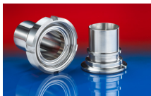
CONNECT ASEPTIC FITTING 249