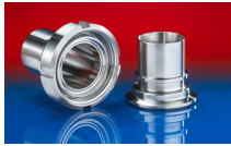
CONNECT ASEPTIC FITTING 249