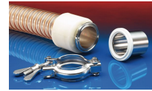
CONNECT TRI-CLAMP FITTING 245