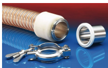
CONNECT TRI-CLAMP FITTING 245