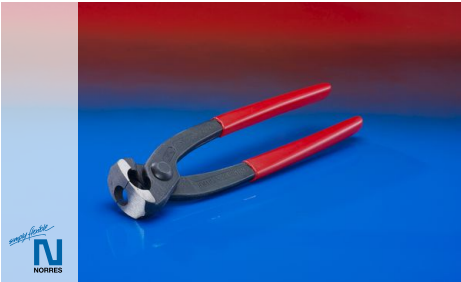
Pliers for assembly of one ear clamps