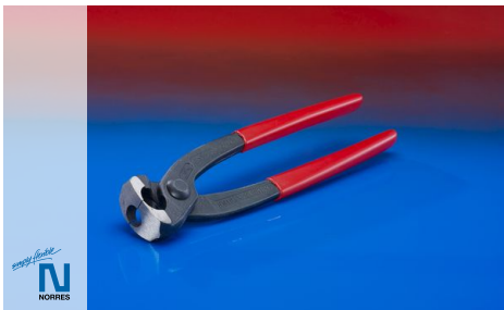
Pliers for assembly of one ear clamps