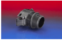
NORDUC® A 183