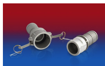
CONNECT KAMLOK ALU 253