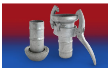
CONNECT KARDAN 254