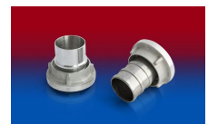
CONNECT STORZ DIN ALU 251