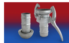
CONNECT KARDAN 254